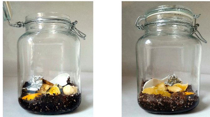
Figure 1. Physical model of landfill bottles in open and closed systems.

Over several weeks, students observe changes in the properties (e.g., color, smell) and weights of the open and closed landfill bottle systems (the curriculum uses the term “weight,” not “mass,” in accordance with the NGSS performance expectation for fifth grade). Over time, students observe that the weight of the open system decreases, but the weight of the closed system stays the same, even as the properties of the food materials change (e.g., a smell is produced). To investigate the cause of these changes, students carry out an investigation with agar plates and figure out that microbes (i.e., a type of decomposer) are present in the landfill bottles and contributing to decomposition. However, students still do not know how the microbes decompose the food materials while conserving weight in the closed landfill bottle system.