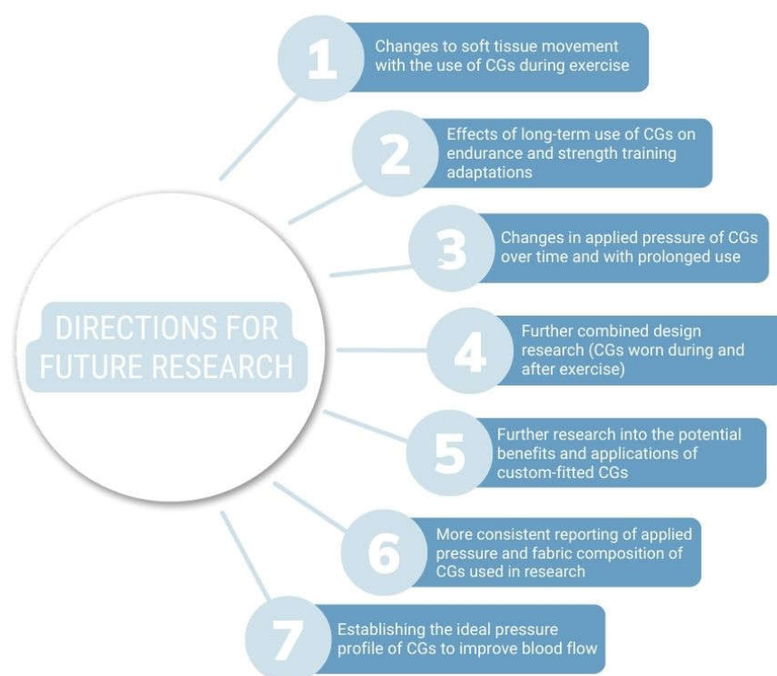
Figure 4. Suggested directions for future research based on the findings of the systematic review.