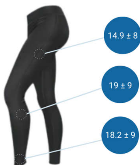
Figure 2. Average applied pressure ( \pm SD) in mmHg reported at the thigh, calf and ankle for compression tights used in included ‘during recovery’ studies. Note: average calculated from 16 studies which reported ‘in vivo’ applied pressure at the time of testing.

A small number of studies also reported the effect of CGs on cardiovascular measures during recovery, including heart rate, blood pressure, and blood flow. Compared to a control group, there was no change in heart rate during 30 or 80 min of recovery following maximal cycling [11,119]. Conversely, Lee and colleagues [120] reported a lower heart rate and higher stroke volume and cardiac output (as measured by Doppler ultrasound) during 60 min of recovery with CGs following submaximal cycling, with a subsequent improvement in maximal power output during a 5-min performance test. This is likely due to the choice of CGs used in this study (leg sleeves worn on top of waist-to-ankle tights), which applied a cumulative pressure of 47.4 \pm 8.8 mmHg at the calf and 24.1 \pm 2.4 mmHg at the thigh, which is substantially greater pressure than the average reported in recovery investigations (see Figure 2). The direct measurement of venous haemodynamics in this study affirms the ability of CGs to improve recovery by way of enhanced venous return, though future research could consider how this may influence subsequent performance longer than 5 min in duration. Additionally, Carvalho et al. [152] reported no change to mean or maximum skin temperature when compression stockings were worn for 24 h following a race pace treadmill run, though how this may change in hot environments is not known.