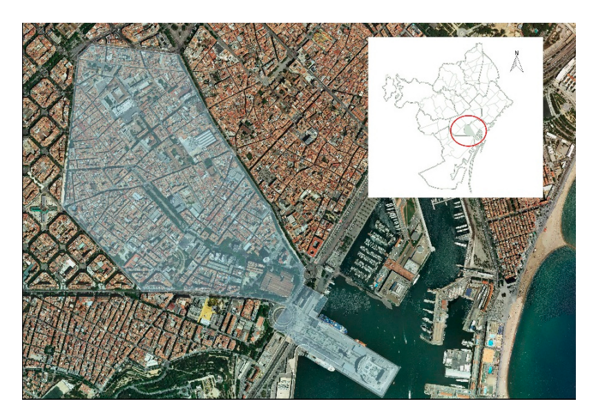
Figure 5. Location of the Raval neighborhood.

For its part, the Raval neighborhood, long regarded as the Chinese neighborhood (denomination coined by journalist Paco Madrid in an article published in the weekly El Escándalo newspaper, in reference to the "chinar" technique employed by many pickpockets of that time) or a rogue area, is located in the Ciutat Vella district (Figure 5). Its defined boundaries are Parallel Avenue to the south (dividing it from the Poble Sec neighborhood); Sant Pau and Sant Antoni Avenues (separating Raval from the Sant Antoni district); and Pelayo Street and La Rambla, marking the division from the adjacent Gothic Quarter. Two large urban projects, Rambla del Raval and Illa Robadors, are located within the zone.