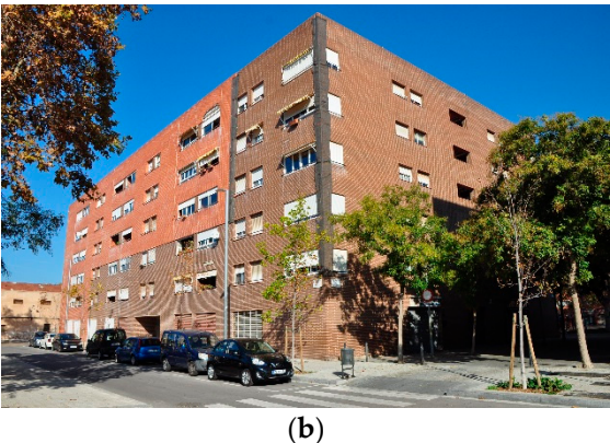
Figure 8. La Marina del Prat Vermell: (a) homes of the Bausili Colony, and (b) deterioration of modern buildings.