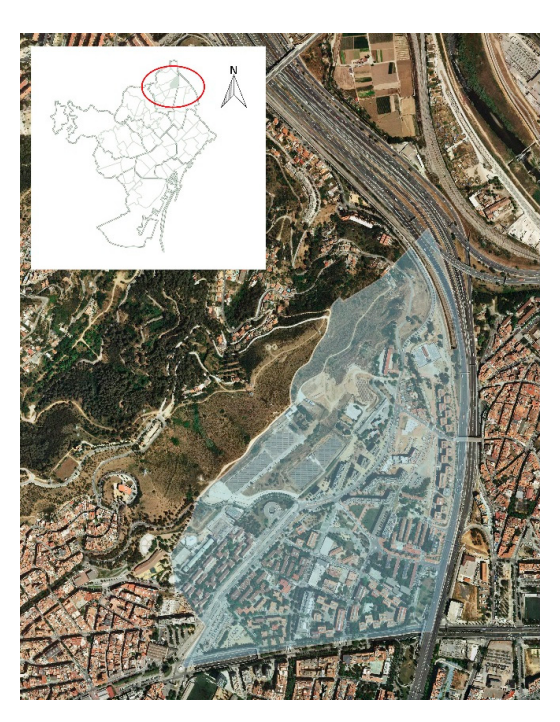
Figure 3. Location of the Trinitat Nova neighborhood.

gradual socio-economic and environmental deterioration of the site (Figure 4a), were the bases for two major urban interventions carried out in recent decades (Figure 4b). The first, in 1997, followed the city's Urban Plan and involved area remodeling through special planning (PERI), improvement of accessibility via the metro, and integration into the ECO-City Project (financed by the European Community within its Fifth Framework Program for Research and Development). The second intervention, the Trinitat Nova Urban Initiative of 2007–2013 (20 million euros) continued the process of integral urban regeneration supported by European and municipal funds. Currently, the Barrios Plan of 2016–2020 (http://pladebarris.barcelona/es), promoted by the Barcelona City Council, consists of ten plans involving 16 city neighborhoods in the city, targeting integrated actions in education, social rights, economic activity, and urban ecology, with a planned investment of more than 150 million euros. Of the four cases analyzed here, three (Trinitat Nova, Raval, and La Marina del Prat) are featured in some of these plans. Trinitat Nova will, without a doubt, see the reduction or elimination of a good many existing problems.