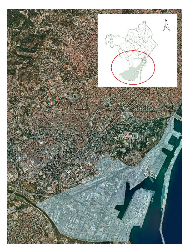
Figure 7. Location of the La Marina del Prat Vermell neighborhood.

This small neighborhood's origins were oriented to agriculture and livestock, and it is located between Montjuïc mountain and the Zona Franca industrial sector. The stamp of the Primo de Rivera regime was visible in the promotion of cheap "Eduardo Aunós" houses of 1929, the demolition/relocation of which in the 1990s made room for today's constructions. Some historic industrial (often obsolete) buildings survive, along with scattered residential nuclei (Figure 8a).