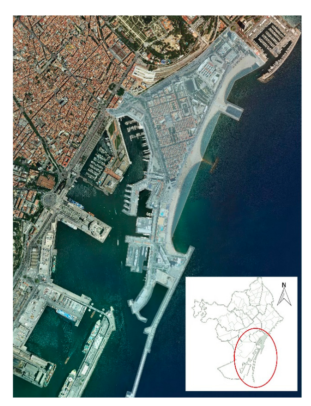
Figure 9. Location of the Barceloneta neighborhood.

This old seaside district (the beach neighborhood), traditionally popular and working class, is strong in character. Urban contrasts exist between the maritime front (the promenade and beaches of San Miguel, San Sebastián, and Barceloneta-Somorostro), and the western border (Moll), and between large corporate headquarters buildings (Gas Natural or Mapfre), casinos, and hotels (Arts) and the residential nucleus, where traditional housing coexists with novel social housing (the MTM (Maquinista Terrestre y Marítima) project, Figure 10a). All of this shares an area limited by the sea and by urban