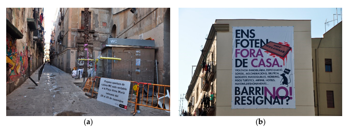
Figure 6. El Raval: (a) rubbish and deterioration, and (b) neighborhood demands.

Our qualitative analysis reveals multiple problems linked to the urban environment such as: the lack of green spaces (the Jardins de Sant Pau del Camp and Rubió i Lluch being exceptions, in addition to the Plaza de Josep Folch); noise pollution and garbage (Figure 6a); difficulty in physical mobility due to the layout and narrowness of streets, and to problems derived from the scarcity of parking; and housing issues including superannuation, poor maintenance or reform, overcrowding, lack of basic facilities and, more recently, tourism outsourcing. Regarding the social environment, the main problems detected here include: difficulty of immigrants to integrate, with clear spatial differentiation by group; the gradual orientation of economic activities towards tourism, with the consequent loss of traditional trade; explicit insecurity, evidenced by robberies of tourists; the marginal activities described above; and the increase in real-estate pressures driven by gentrification (Figure 6b).