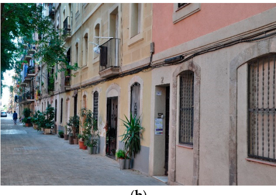
Figure 10. La Barceloneta: (a) social housing in MTM, and (b) small houses.

Problems linked to the social environment are here fundamentally due to intensive tourism, which the neighborhood supports, also reflected in the commercial tertiarization towards this sector (hospitality) and in the lack (or expulsion) of local commerce. As a consequence, the (latent, at least) social uprooting of the residents is another growing concern.