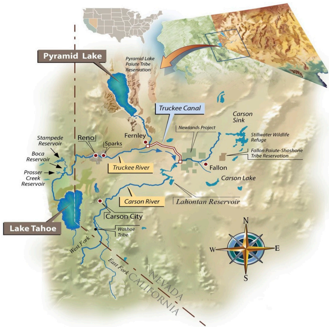
Figure 1. Truckee-Carson River System.

The Carson River also originates in the eastern Sierra Nevada as snowpack. Within the 10,270 m 2 area basin, nearly 15% of the total area is located in eastern California, while 85% is located in northwestern Nevada [31]. As with the Truckee River, a federal compact regulates interstate resource sharing. The Carson River involves the oldest litigation over water right adjudication in the United States, with one case alone spanning 55 years, and resolved through the Alpine Decree (1980), which today is the primary governance regime over that river's water rights allocation [31]. Since 1915, its waters have been captured and stored in Lahontan Reservoir to supply additional agricultural irrigation water for the Newlands Project downstream and surrounding rural communities [30].