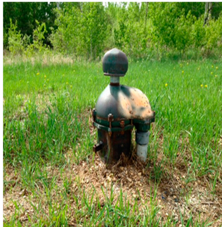
Figure 5. Unprotected community well-head (vegetation encroachment, no mounding).