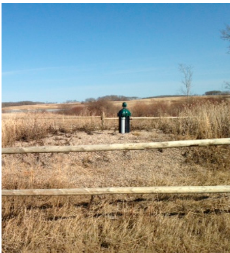
Figure 6. Protected community well-head (extended well casing, fence, gravel mounding).