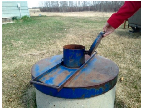
Figure 4. Household water cistern.