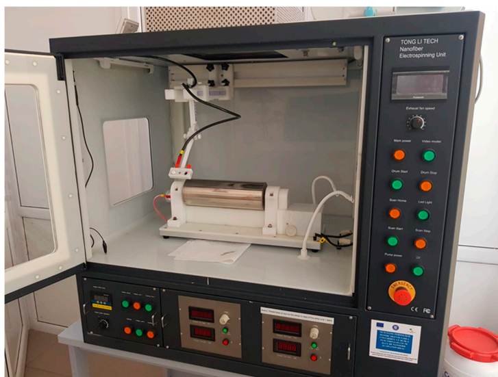
Figure S1. TL-Pro-BM Electrospinning equipment

*Correspondence: cristina.orbeci@upb.ro; Tel.: +40721259875