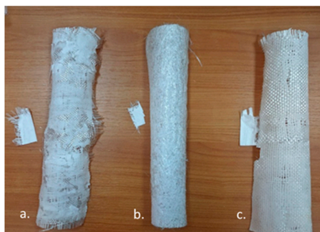
Figure S2. Photocatalytic membranes based on PLA/TiO 2 hybrid nanofibers coated on different types of fiberglass: (a) fiberglass fabric one fold edge-type membrane (EWR); (b) fiberglass mat-type membrane (EMC); (c) fiberglass fabric plain woven-type membrane (TEX).