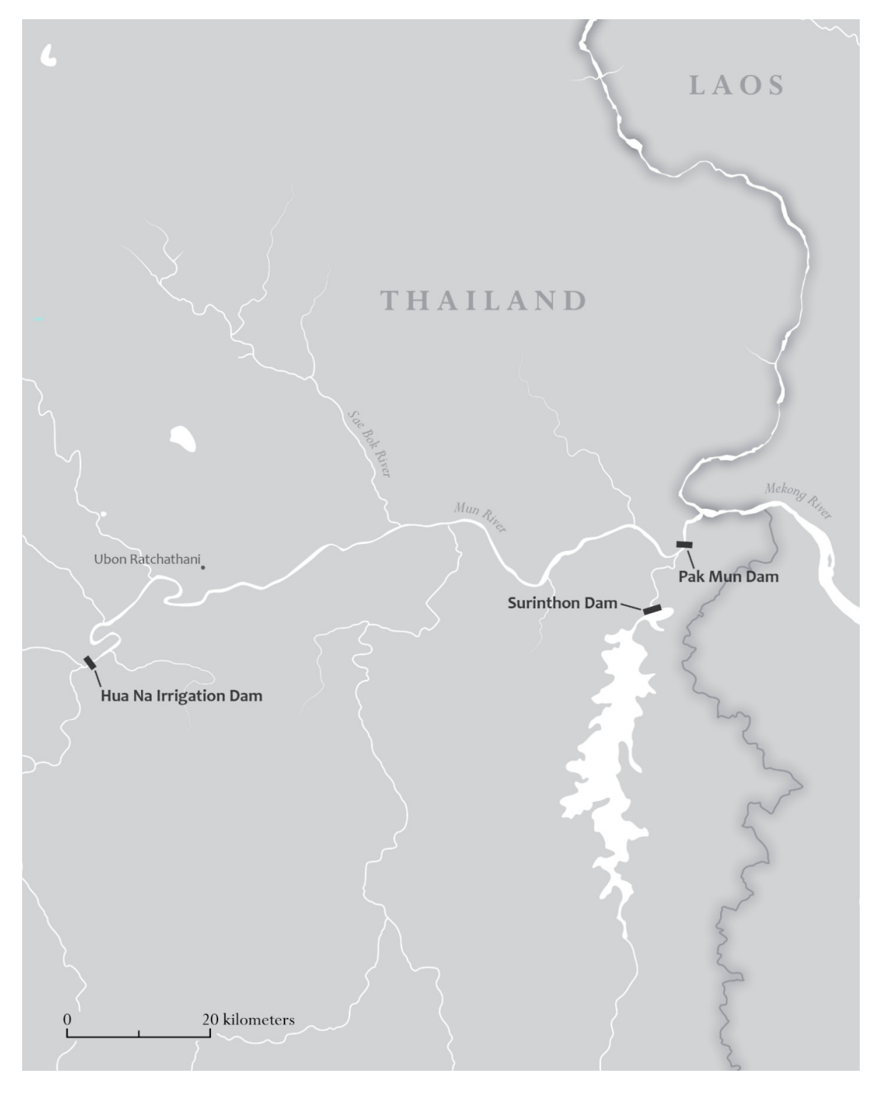
Figure 3. The Lower Mun River Basin, including the Pak Mun, Hua Na, and Surinthon dams, northeastern Thailand.

outside of the reservoir area also face problems of declining fish catches. The Pak Mun Dam is directly responsible for these declines because it blocks migrating fish from moving between the Mun and Mekong Rivers [10,71–78]. Even with a fish ladder that was added later to mitigate the loss of migratory fish, upstream fisheries have declined. Very few fish use the fish ladder, and the disruption of, and changes to, the river's hydrology has negatively affected the livelihoods of peoples in the entire basin [76–78].