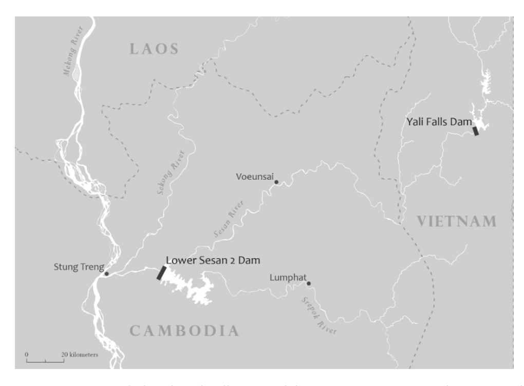
Figure 1. The Sesan River Basin, including the Yali Falls Dam and the Lower Sesan 2 Dam, northeastern Cambodia and the Central Highlands of Vietnam.