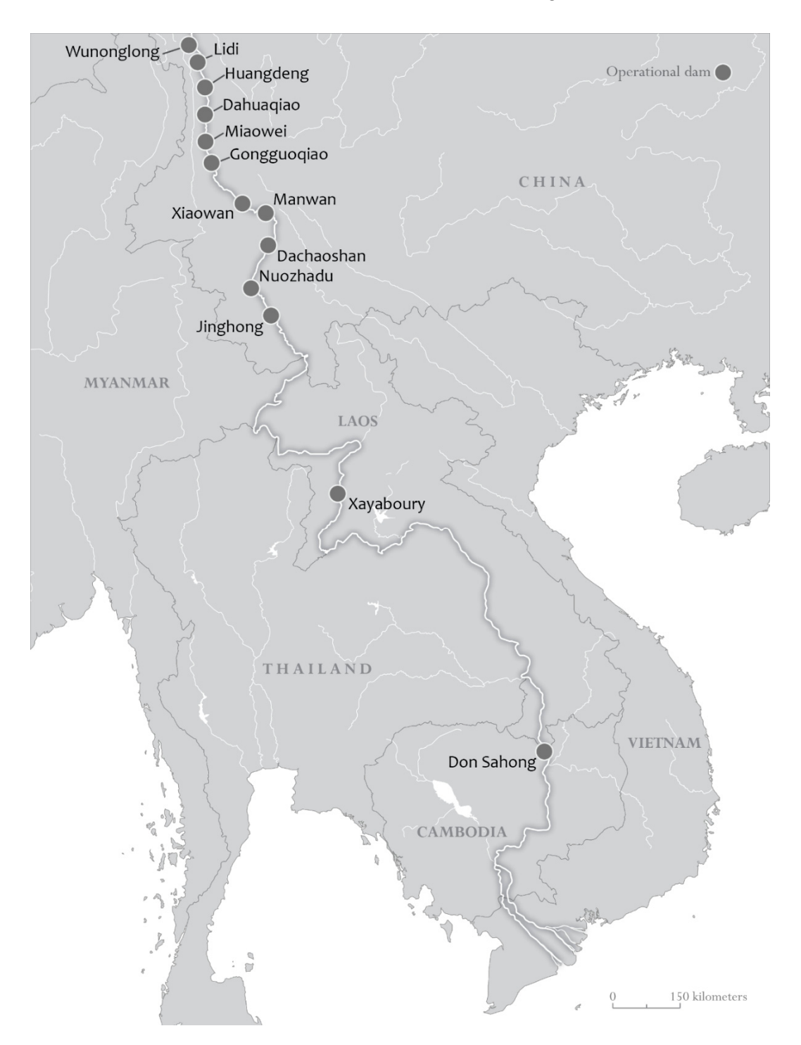
Figure 4. The Mekong River Basin, including hydropower dams built on the mainstream Mekong/Lancang River in China and Laos.

has a long history of non-cooperation in the Mekong Basin, at least when it comes to discussing its own plans for dam-building on the Mekong. Downstream impacts are rarely considered, and never sufficiently [84,85]. Within China itself, the lack of transparency and collaboration with local actors is also concerning [86].