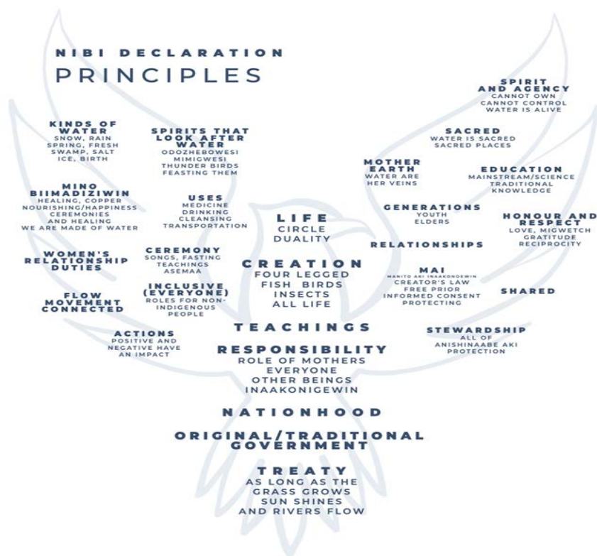
Figure 2. Nibi Declaration Principles [2]. Copyright 2020 NIBI.

At the direction of The Women’s Council, the Gitiizii m-inaanik that were engaged reflected a balance of male and female, in recognition that female Gitiizii m-inaanik generally carry the knowledge and ceremonies relating to water, and the men are responsible for supporting them [24]. The Gitiizii m-inaanik provided the foundation for the process, as they are the sources of knowledge through their experiences and relationships. The Gitiizii m-inaanik provided teachings about community and relationships inclusive of the mental, physical and spiritual dimensions [24]. This source of guidance and education led to a community and nation-based engagement that was rooted in ceremony and principles of Anishinaabe inaakonigewin . One of the participants in this session, Ogichidaa (Grand Chief) Kavanaugh, drew a Thunderbird around the visual representation of the principles (as illustrated below in Figure 2). The re-drafted Declaration was then taken to ceremony and feasted.