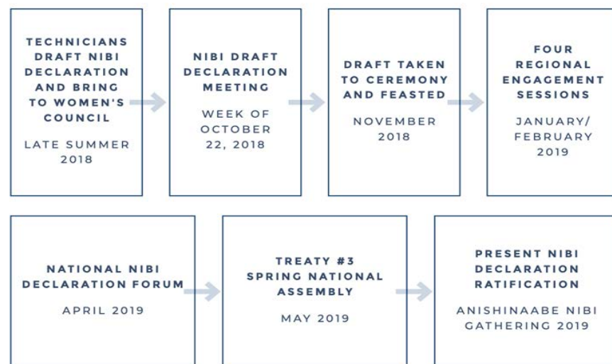
Figure 3. Timeline of the Nibi Declaration [2]. Copyright 2020 NIBI.

Technicians and members of The Women's Council facilitated sessions across the four regions of the Territory (Kenora (twice), Dryden, and Fort Frances). In each session, regional particularities (language, teachings, songs, etc.) were identified. An important piece of the regional diversity feedback was on the terms used to refer to water and types of water. Since language is central to Anishinaabe ways of knowing, the connection to oneself and teachings on how to live a good life [16,17], a decision was made to use the common term in Anishinaabemowin—Nibi—to reflect all forms of water.