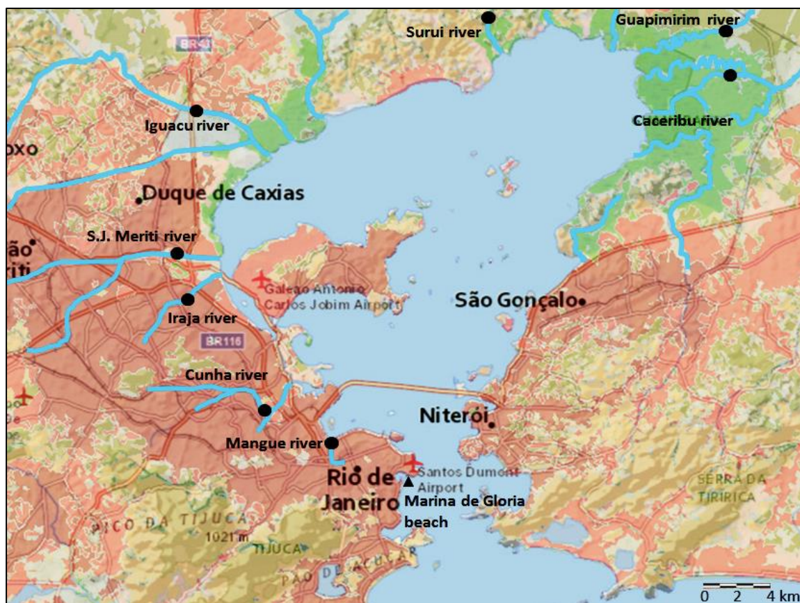
Figure 1. Guanabara Bay and its major input rivers with the sampling locations. Black circles represent the locations of sampling in freshwater rivers. A triangle represents the saltwater marina from samples of the bay that were taken.

Guanabara Bay (Figure 1) lies along the northern coast of Rio de Janeiro, the second largest city in Brazil and home to one of largest urban populations in the world [17]. The Guanabara Bay drainage basin receives most liquid effluents produced from the greater metropolitan area of Rio de Janeiro, one of the most industrialized coastal areas of Brazil. Of the 11.8 million inhabitants in the Rio de Janeiro City metropolitan area, 70% are located within the Guanabara Bay drainage basin [18].