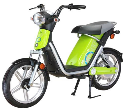
(b) E-Mo, E-Ton