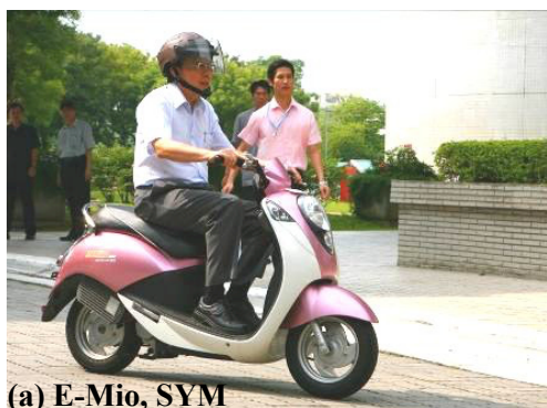
(a) E-Mio, SYM

Government optimistically prospect the future development can be expanded the target amount of electric scooter from one hundred thousand to one hundred and sixty thousand. Hopefully, the development of electric scooter would benefit Taiwan industries as well as to help on decreasing the air pollution of the world.