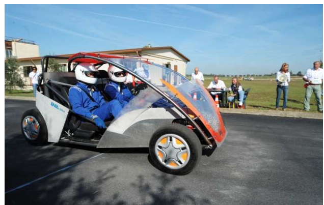
Figure 6: Series hybrid prototype, with supercapacitors, by Roma La Sapienza – Roma TRE – ENEA

Both systems, with series architecture, are making use of supercapacitors as energy storage system.