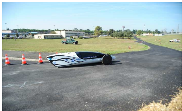
Figure 9: IDRA 08 on the competition track

Consistently with the new body shape, the steering system and the control command have been studied to match the constraint of the body shape and the light weight with the requirement of safety and ergonomic aspect.