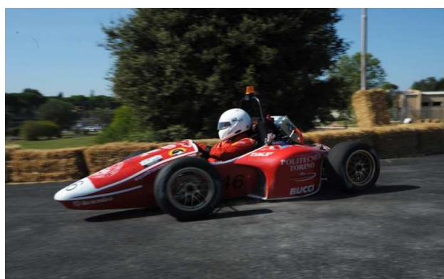
Figure 2: Squadra Corse car during the competition