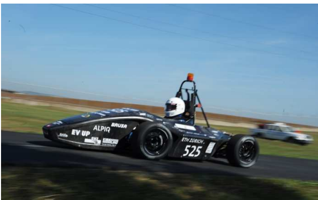
Figure 4: ETH Zurich car on the competition track

Both cars have demonstrated very good operational performance and have been classified at the first and the second place in Class 1.