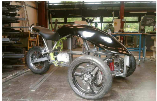
Figure 8: The threewheeler TrecolLITH by Linköping University

threewheeler with tilting body, with two electric motors directly integrated in the rear wheels [2].