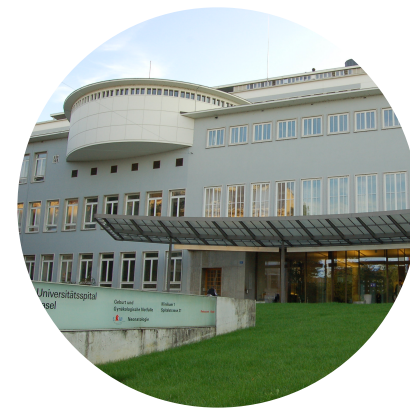
Research and academic institutions