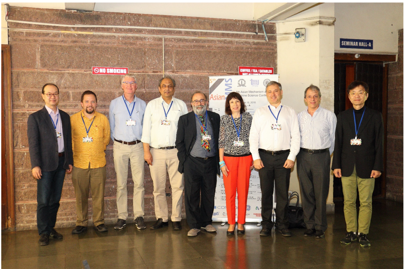
Figure. Participants at the EC meeting of 17-18 December 2018 (Bangalore, India)