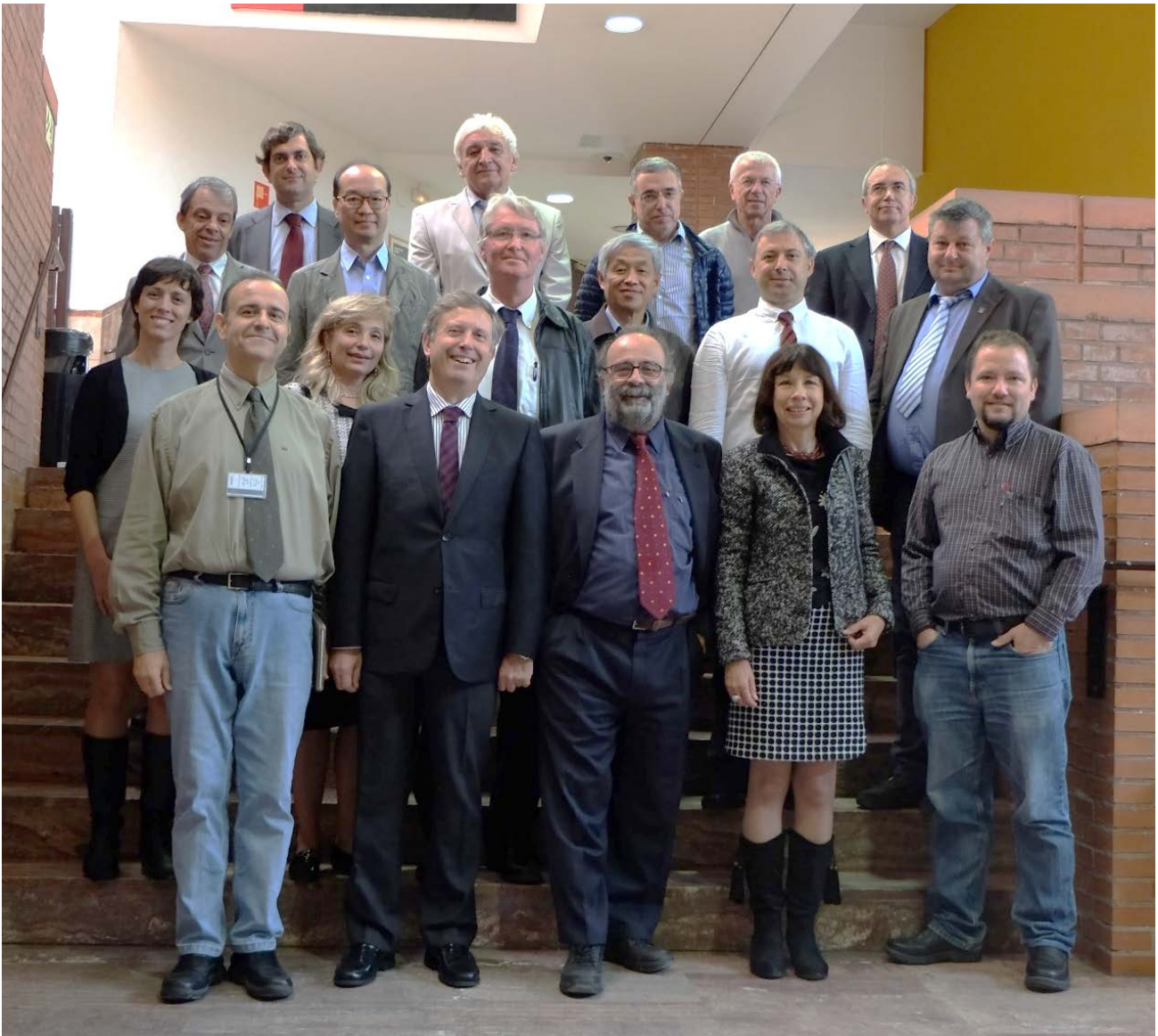
Figure. Participants at the 2016 EC meeting in Leganes, Spain on 19-20 October 2016: