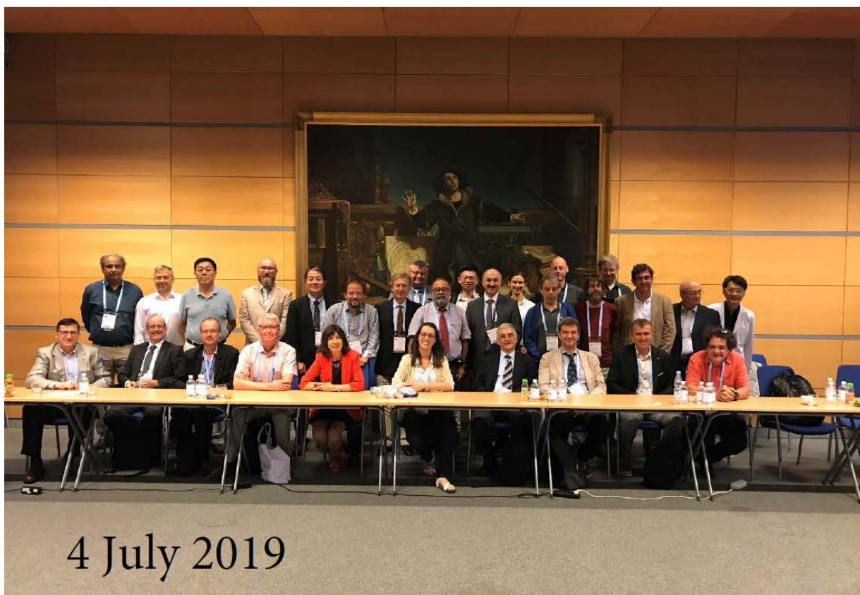
Figure. Participants at the EC meeting of 30 June and 4 July 2016 in Krakow, Poland, during 2019 WC