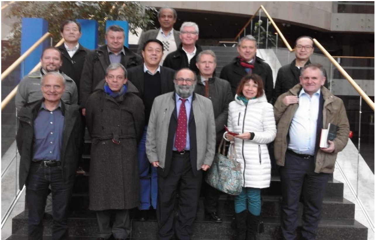
Figure. Participants at the 2017 EC meeting in Krakow, Poland on 9-10 October 2017