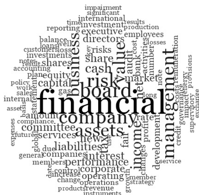
Figure 2. The most used words in the 2016 reports.

The frequency of use of the words related with the categories of EPIs is presented in Table 5.