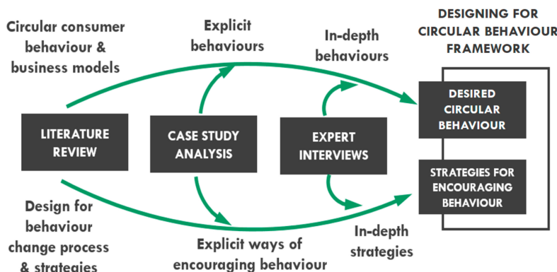
Figure 1. Research approach for building the framework.

Figure 1 shows an overview of the iterative research process which was used to build the framework, the output of which is a description of desired circular behaviours as well as strategies for encouraging this behaviour. Both components were developed through a literature review, case study analysis and practitioner interviews.