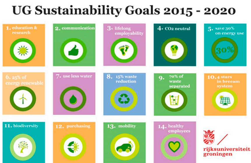
Figure 1. University of Groningen (UG) sustainability goals on the Roadmap 2015–2020.

The plans and the ambitions for sustainability have been set out in the Roadmap 2015–2020. The Roadmap is published to inform, but also to initiate discussion/interaction with employees, students, and other stakeholders on the current and new ideas. “A better University, a better world”—that is what the university wants to achieve with its 14 sustainable goals (Figure 1). Working on various initiatives in order to achieve these goals, the university aims to create a broad support base for its sustainability ambitions in cooperation with as many stakeholders as possible.